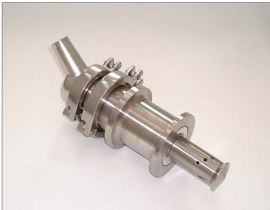
Double-wall flush mount nozzle in open position.

EDT's liquid-activated retractable CIP Spray Nozzles are superior components designed specifically to remain in place during production in sanitary food processing applications.