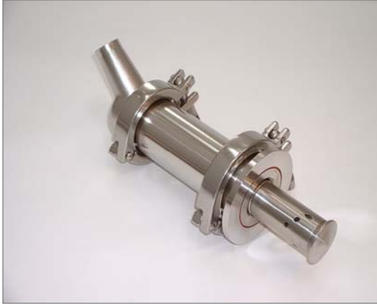
Flush mount nozzle in open position.